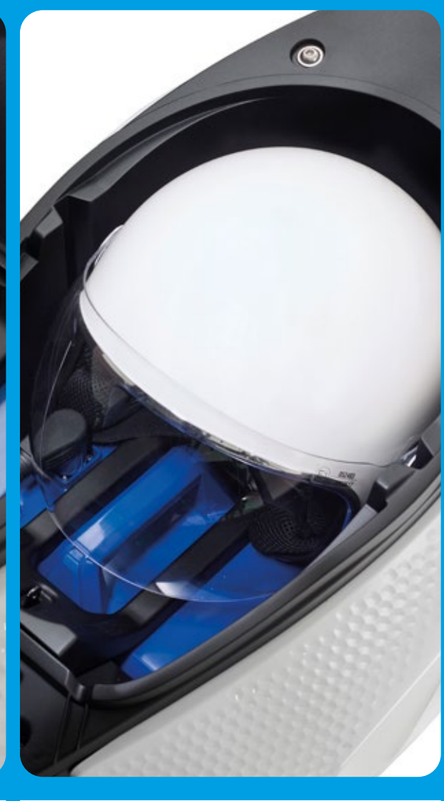
LIGHT UP YOUR ROAD